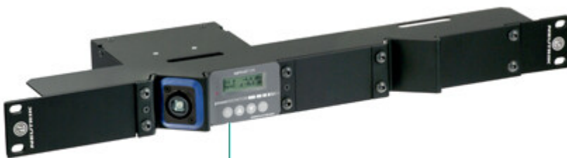
NO4S-4F-2R-PM (up to two power Monitors)