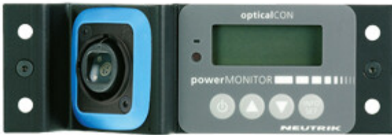
Front view: e.g. 4F (opticalCON QUAD)