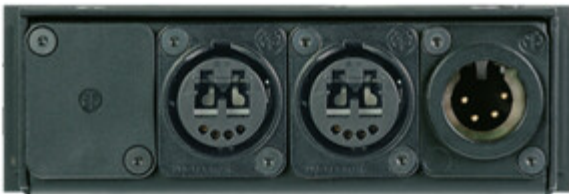
Rear view: e.g. 2R (opticalCON DUO)