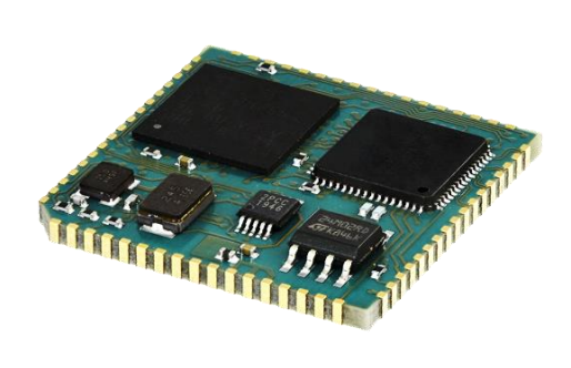
Graphic: 01 neutrik_minea_product_detail

The MINEA modules and the correspondent development sets will be available Q1/2021. For more information on this solution, please visit <u>www.neutrik.com</u> or contact your local Neutrik sales agent.