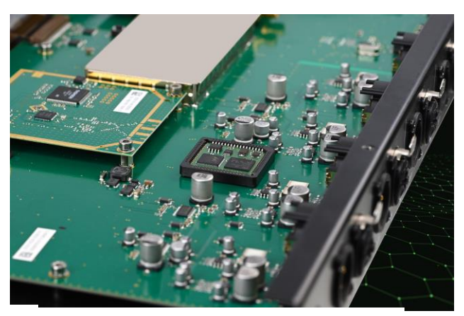
Graphic: 02 neutrik_minea_image